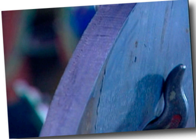
Natural gas makes clean cuts with little slag, square corners and a smooth cut face

Get Superior Performance With High-Pressure Natural Gas!