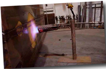
Natural gas can be used at any pressure and there are no valve icing problems when you heat with natural gas